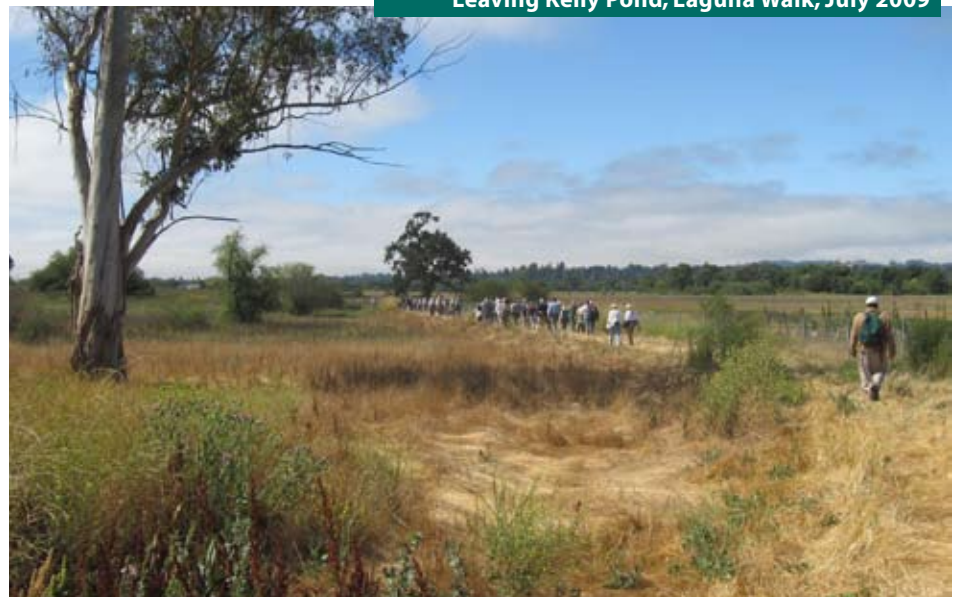
Leaving Kelly Pond, Laguna Walk, July 2009