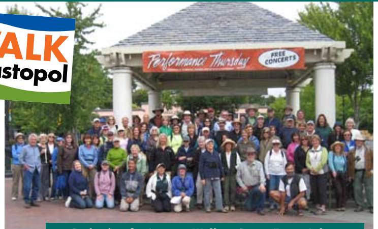
Gathering for Laguna Walk to Stone Farm, July 2009

Walk with us in 2009! This year's schedule includes old favorites from the book and NEW routes to local sites you might not have seen.