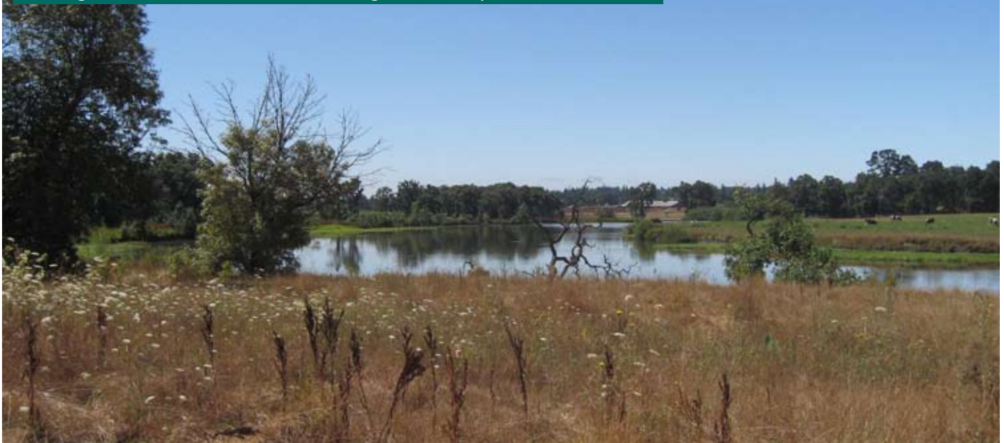
Looking South from near Occidental Road, Laguna Walk, July 2009