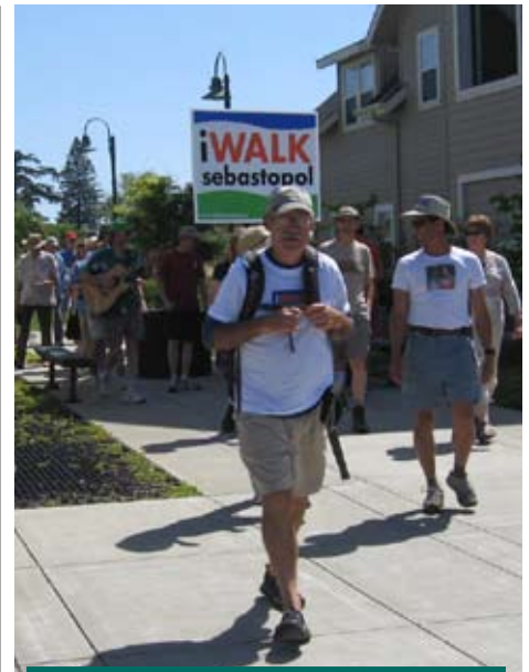
iWALK Kick-off Event, May 2009