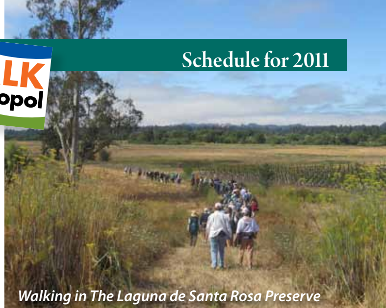
Walking in The Laguna de Santa Rosa Preserve